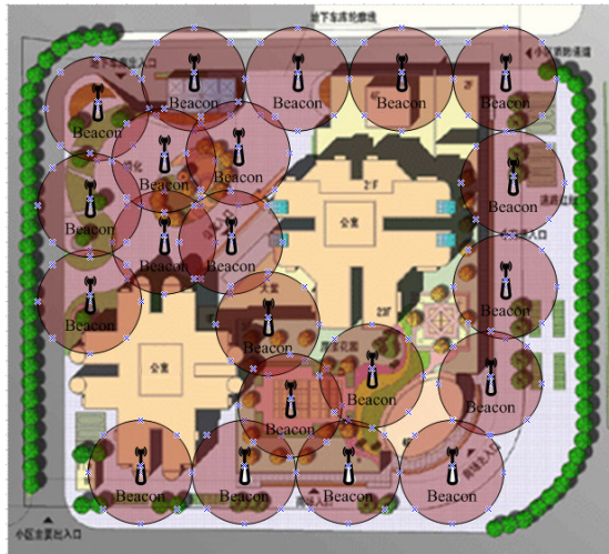
Figure 3. Beacon and Gateway in the public Area