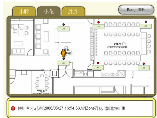
Figure 2. Tracking information in the family monitor.

People Tracking Service (PTS) provides a real-time tracking of particular person wearing a badge. This service is for family members only. But for private issue, security guard in control center cannot keep track information of other people apart from family members. Figure 2 shows tracking information in the family monitor.